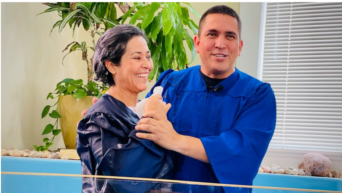
Twenty-four Hispanic Churches met September 25-October 2 for an evangelistic effort, titled "Victoria frente al temor" (Victory Over Fear). Guest speakers from throughout the United States joined the Illinois Conference to