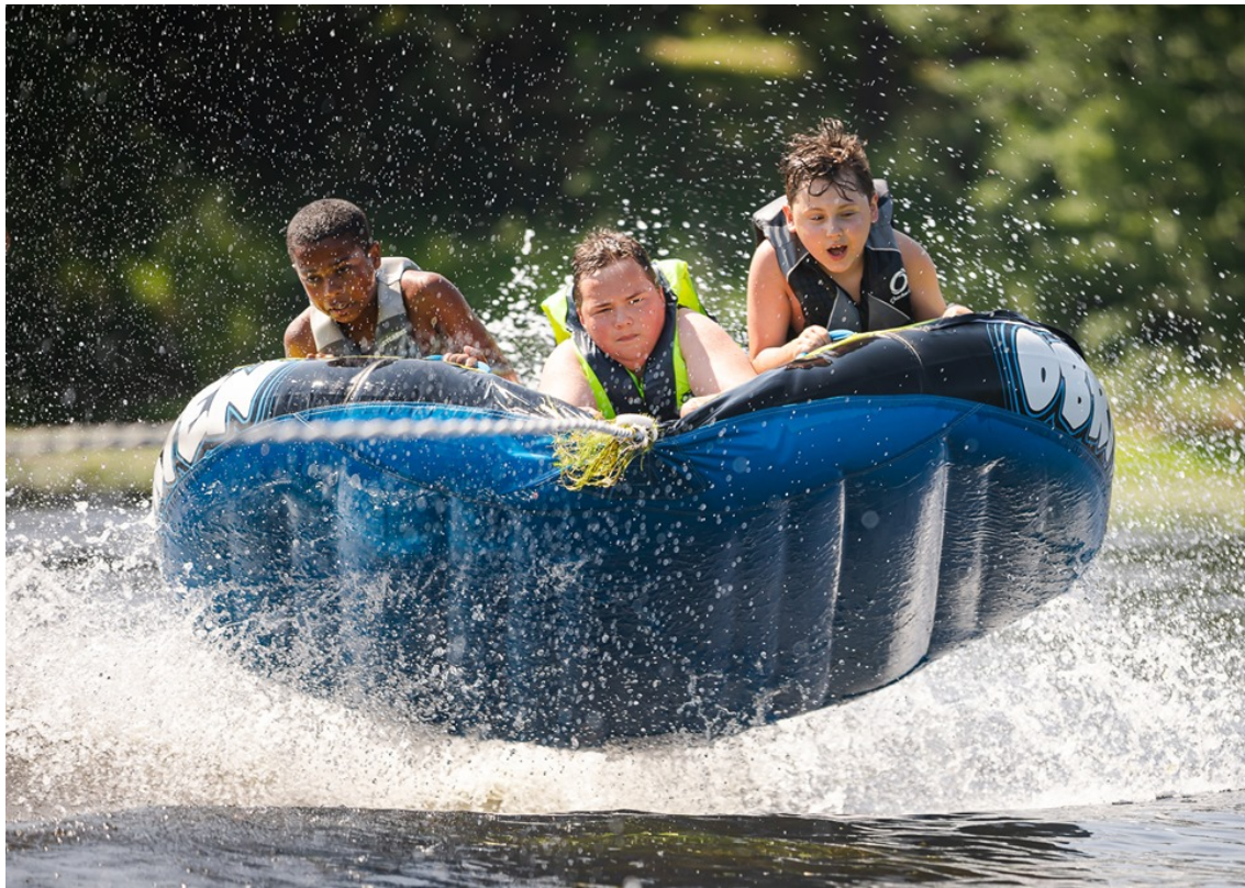
What a ride! Tween campers at Camp Wakonda hanging on for dear life.