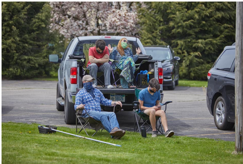
A family worships last Sabbath during the drive-in worship service in the parking lot of Harbor of Hope Church, Benton Harbor, Michigan.