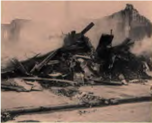
A large section of Chicago's West Side was left in ashes and rubble after recent riots.