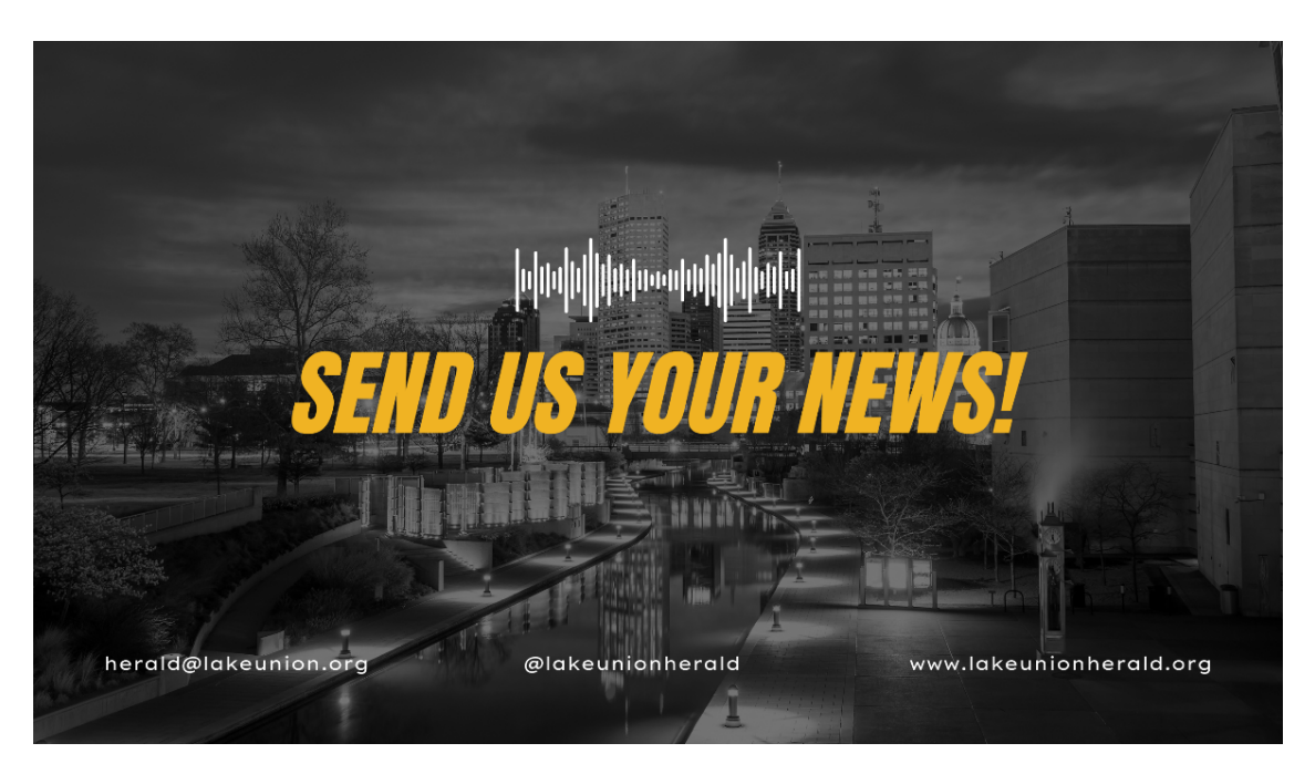
Thanks for reading the Lake Union newsletter. <u>Please share</u> it widely.

Congratulations to all the Andrews University graduates! We look forward to seeing where God leads in your next adventure. \checkmark